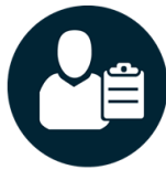
ACP Contact Center Manager