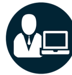
ACP Technical Support

For more information on certification, please consult the Altitude University Knowledge Hub.