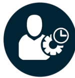
ACP System Administrator