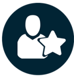
ACP Team Leader