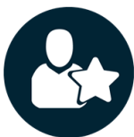
ACP Team Leader