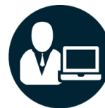
ACP Technical Support

For more information on certification, please consult the Altitude University Knowledge Hub.