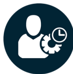
ACP System Administrator