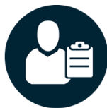
ACP Contact Center Manager