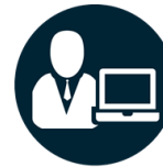
ACP Technical Support

For more information on certification, please consult the Altitude Learning Hub.