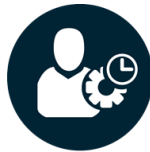
ACP System Administrator