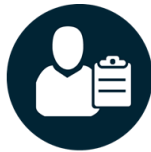
ACP Contact Center Manager