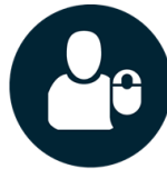
ACP Solutions Developer