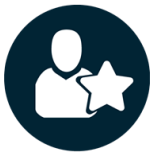
ACP Team Leader